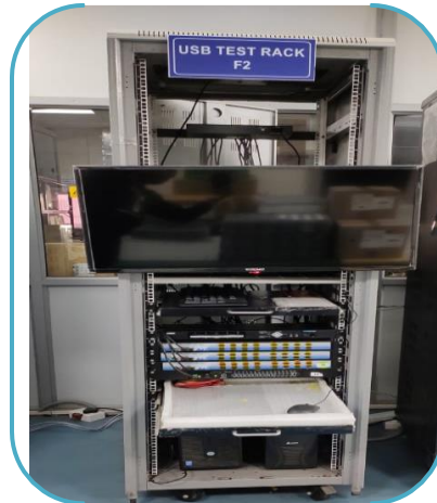
Functional Test 2