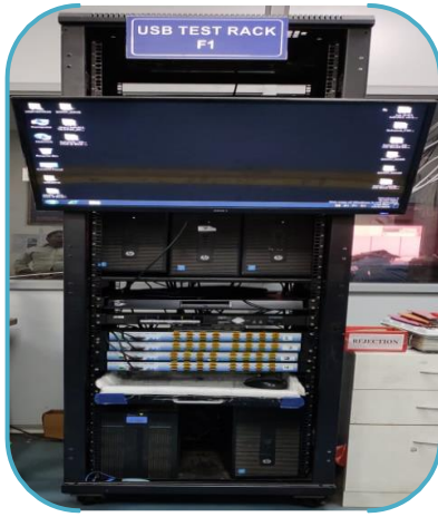
Functional Test 1