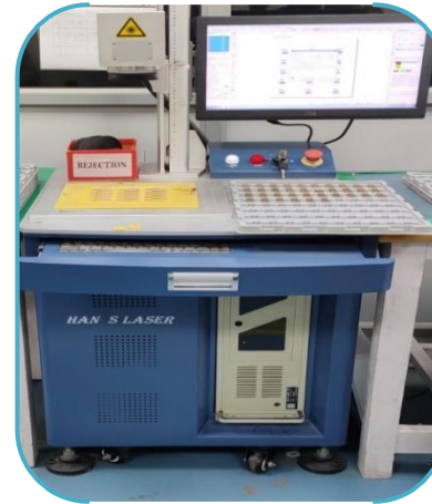
Laser Marking Machine