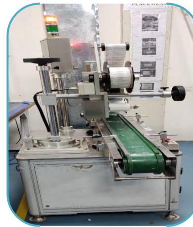
MRP Label Machine