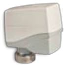
Actuator E8X-VAVTP (Qty 5)